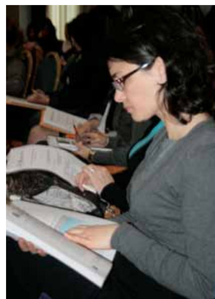
Conference on Census, Tirana

During the first half of 2011, United Nations Population Fund (UNFPA) support was provided in collaboration with UN Women and United Nations Fund for Children (UNICEF) with a focus on developing national capacities to advance data analysis. A dynamic programme of training and technical assistance was provided to around twenty researchers from INSTAT, Institute of Public Health (IPH), academic institutions and Non-Governmental Organisations (NGOs). Researchers were trained in advanced statistical techniques, analysis and interpretation of results and drafting papers for publication. Technical guidance was also