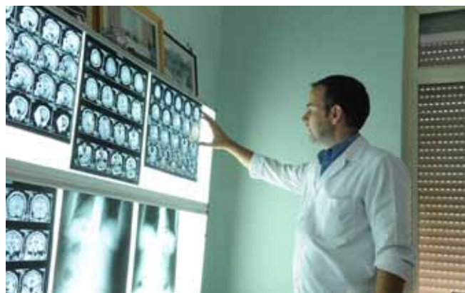
Health care centre

For Early Childhood Development (ECD), UNICEF supported GoA in modernising procedures for birth registration (including assisting Roma families with necessary paperwork and in courts), introduced comprehensive ECD training modules for professional caregivers, developed spatial–physical planning standards for nurseries (crèches) and produced a detailed costing analysis of services offered by crèches (including possible ways to optimise the existing system of day-care subsidies to better focus on the families most in need). UNICEF's support to 400 pre-primary classes, which correspond to about 25 percent of all basic education schools, was among the factors that contributed to an increase in pre-school enrolment among five–six year-olds, from 50 to 70 percent. Trainings in better parenting and medical check-