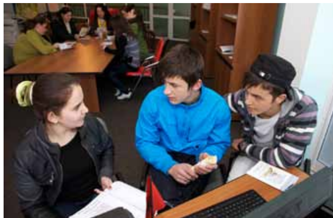
Youth Employment Services centre, Shkoder

With UNDP and UN Conference on Trade and Development (UNCTAD) support, the new Foreign Direct Investment (FDI) Agency (AIDA) started its preparations for the Foreign Direct Investment Report 2011. The World Investment