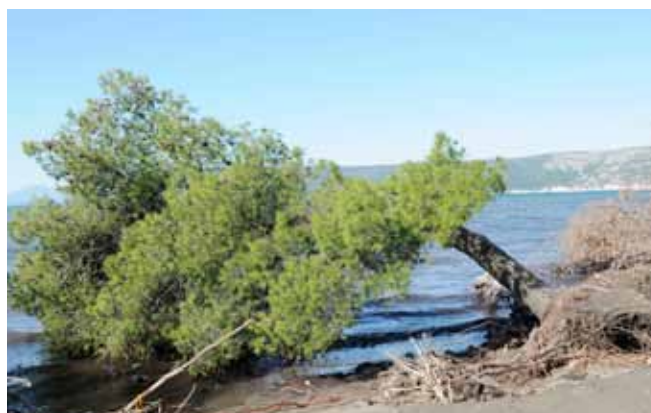
Climate change impact, Lezhe

Within the framework of the first climate change project in the region—Identification and implementation of adaptation measures in the Drin–Mat area—UNDP supported Lezha Regional Council to integrate climate change and adaptation into development of new sectorial strategies, including tourism, agro-tourism and forestry. In addition, UNDP supported new development plans for three communes in the locality. As a follow up to regional and communal adaptation plans, a GIS map of the communes' adaptation measures was prepared, supported by the economic estimates of the adaptation measures based upon a vulnerability and risk assessment analysis of the area. Ministry of Environment, Forests and Water Administration (MoEFWA) was supported by UNDP to include climate change adaptation in the management plans of protected areas. An Integrated Monitoring System was established with UN support. As a conceptual framework, the system includes a detailed set of indicators to be monitored in order to understand ecosystem responses to climate change and the effectiveness of the adaptation measures.