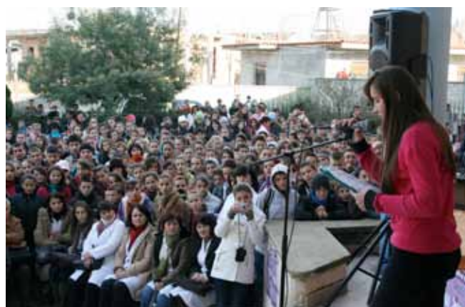
Gender equality campaign in school, Tirana

In the context of revision of the Justice Strategy, UN Women provided technical support to include gender equality obligations in this strategy for the first time. With UNDP support, and based on successful local