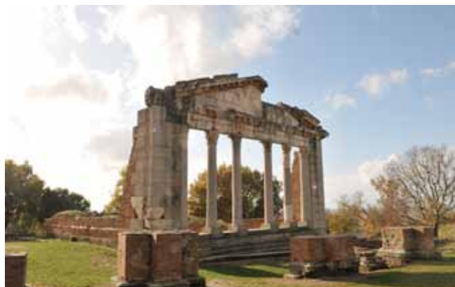
Apollonia archaeological site

With United Nations Educational, Scientific and Cultural Organization (UNESCO) and UNDP support, and financed through the Spanish MDG Achievement Fund, rehabilitation of the ethnography pavilion at the National History Museum (NHM) and the works for reopening the Apollonia archaeological museum were completed, while those for renovation of the NHM conference room continued to progress. Visitor information tools produced for the archaeological site of Antigonea and for the city of Berat have improved the visitor's experience. Meanwhile, the artisan incubator in Gjirokastra continues to operate. Visitor information quality has improved with completion of a cultural heritage signage project in the historic centre of Gjirokastra and the opening of a new tourism