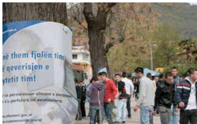
Introducing ICT at local level

The UN continued to support the implementation of the Paris Declaration in 2011 by contributing to the preparation of an Organisation for Economic Co-operation and Development – Development Assistance Committee (OECD–DAC) survey and of its Gender Equality Optional Module. In support of the implementation of the Paris Declaration principles, UN Women enabled the participation of representatives of the Government and civil society to the fourth High Level Forum on Aid Effectiveness in Busan.