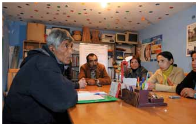
Roma Community members identifying their development priorities, Elbasan

In late 2011, an evaluation of the Social Inclusion Strategy (2007-2013) was initiated with UNICEF support. The Social Inclusion Strategy comprises measures related to social protection, health, education, employment, justice, water supply and transport specific policies. The review of this strategy will focus on the effectiveness of the social inclusion framework to capture progress by a variety of stakeholders in specific areas, and will assess the coordination and monitoring capacity of MoLSAEO, including in the area of data management systems.