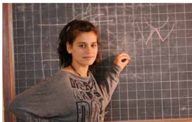
Education for all

In the area of basic education, UN-supported interventions are guided by the National Education Strategy 2004–2015, which links reform of the sector with improved governance in MoES and its regional branches, greater school autonomy and the establishment of accountability tracking mechanisms that would involve parents and communities. Decentralisation shifts initiated in the mid-2000s transferred many operational tasks to the Regional Education Directorates (REDs), municipal and communal authorities and school administrations, but adequate re-distribution of managerial and technical capacities lagged behind.