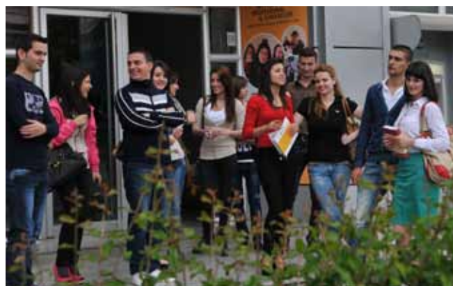
University students, Tirana

UNICEF continued to support Youth Parliaments at national and local levels to increase the access of youth to information and capacities to participate effectively in public decision making. Youth Parliaments were strengthened to act as a strong advocacy youth network, addressing youth concerns, by putting human rights and gender issues high on the public agenda. Youth Parliaments are now active members in the twelve regions, where they facilitate the creation of specific bodies or committees composed of representatives of youth and local authorities, enabling young people to express their opinions and have a say in public decision making. As examples, the Youth Parliament in Durres succeeded in introducing a specific budget line for youth activities, in Lezha, the Youth Parliament strongly advocated environmental issues, and in Shkodra, young people are collaborating with the Employment Services to ensure that youths more in need are reached, while in Gjirokastra, it has facilitated cross-border interaction with youth in Greece.