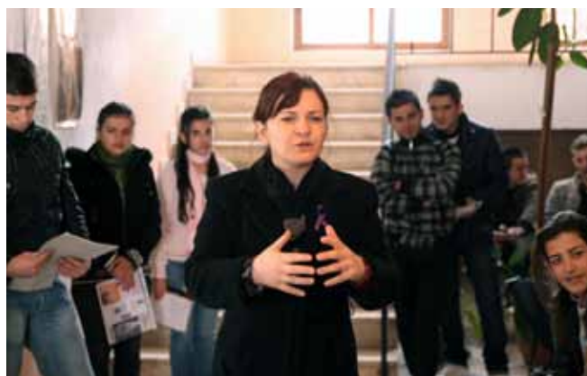
Raising awareness among youth on gender based violence, Tirana

UN Women promoted the effective use of media and communication tools by NGOs to strengthen their capacity to promote women's leadership, women's rights and gender equality. As a result, NPOs organised (i) national and local talk shows where scorecards, quota, family voting and women participation in decision making were discussed, (ii) local and national press conferences to launch the results of the community-based scorecards, and (iii) a national press conference to request implementation of the quota by political parties. Moreover, with UN Women support, a network of NPOs signed a framework of cooperation with the Union of