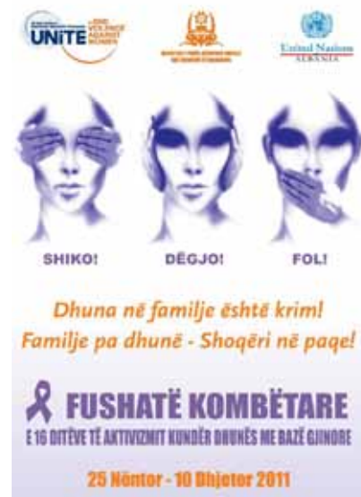
Poster produced for Violence Against Women campaign

In June 2011, GoA, with UNDP support, opened the first national shelter for survivors of domestic violence. This represents a considerable investment, in terms of infrastructure work and purchase of equipment and furniture, but, more importantly, also as a solid legal and institutional framework in which the shelter will operate. To this end, UNDP provided technical assistance for: i) MoLSAEO to develop a